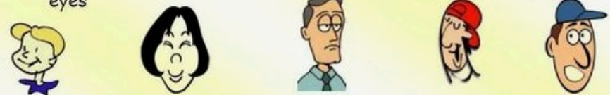
small nose turned-up nose straight nose hooked nose long nose