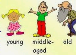
young middle-aged old