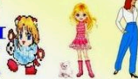
short medium-height tall