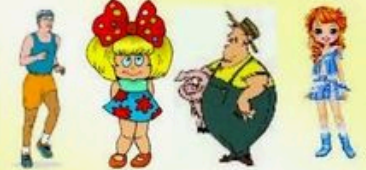
well-built plump fat slim