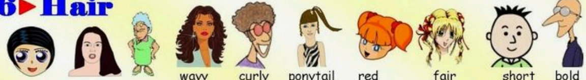
short black hair long black hair grey hair wavy brown hair curly hair ponytail red pigtails fair hair (plaits) short spiky hair bold