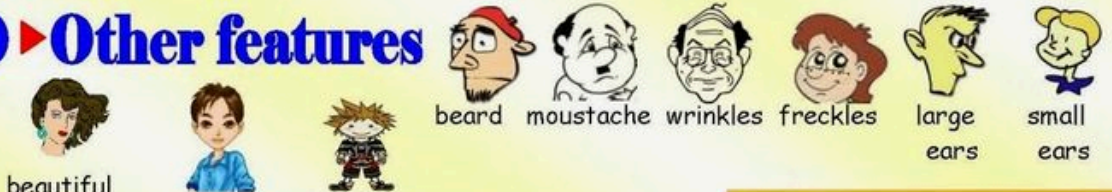
beautiful (pretty) handsome ugly beard moustache wrinkles freckles large ears small ears